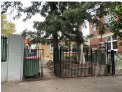
Learning Street Entrance