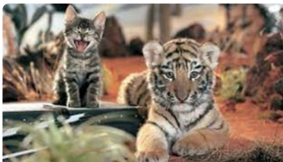
It's ok little kitty

It was great to see the many colours of the various football teams celebrated on Monday. There was an abundance of yellow and black and very happy Richmond supporters. The children had an exciting day, engaging in a morning parade of colours, followed by the opportunity to practise